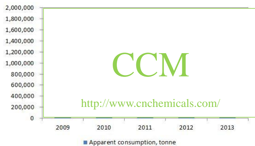
Figure 1.5-1 Apparent consumption of modified starch in China, 2009-2013